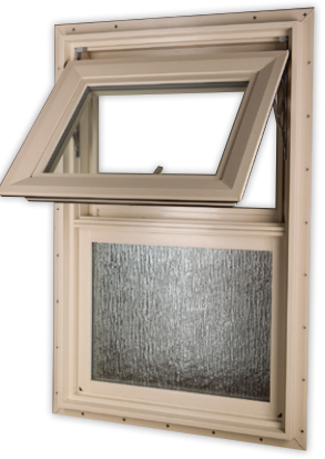
Awning with Obscure Glass