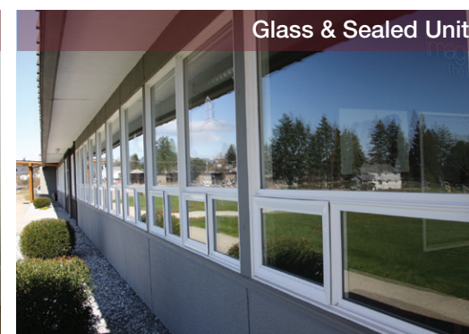
Glass & Sealed Units