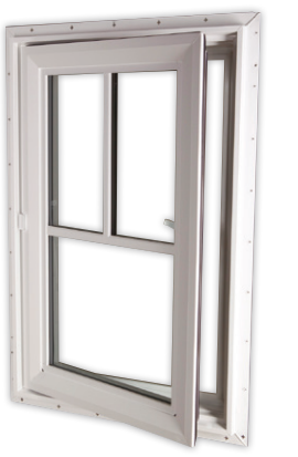
Casement with Exterior Grids