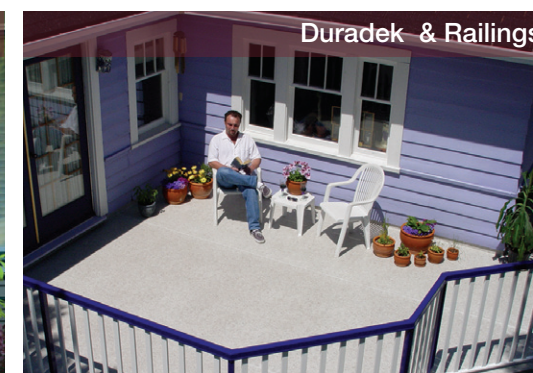
Duradek & Railings