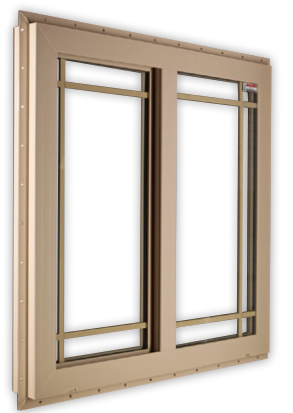
Horizontal Slider with Interior Grids