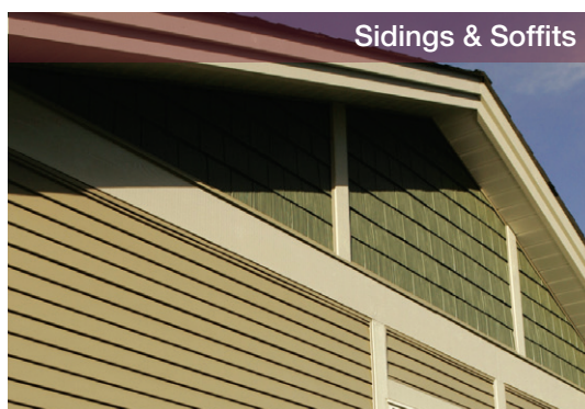
Sidings & Soffits