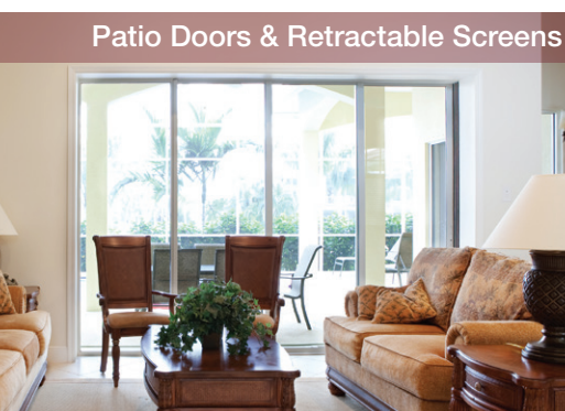
Patio Doors & Retractable Screens