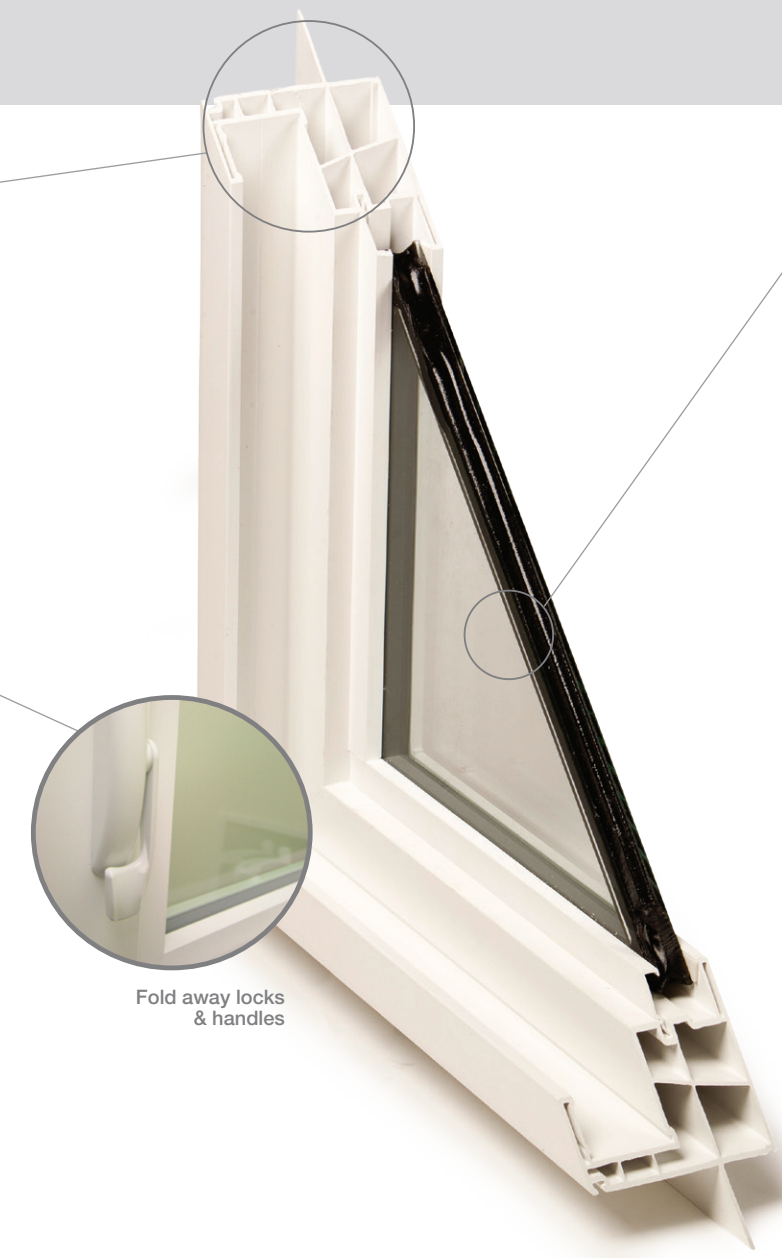
Fold away locks & handles

Our windows meet and/or exceed NAFS requirements - modern.ca for more details. Please confirm window ratings are acceptable with your local building department.