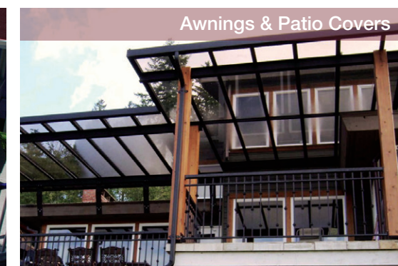
Awnings & Patio Covers