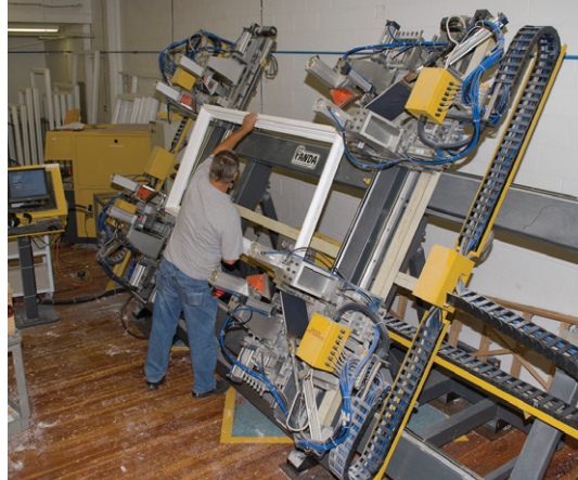
Our QAI approved Factory in Powell River, BC. Manufacturing windows since 1984.